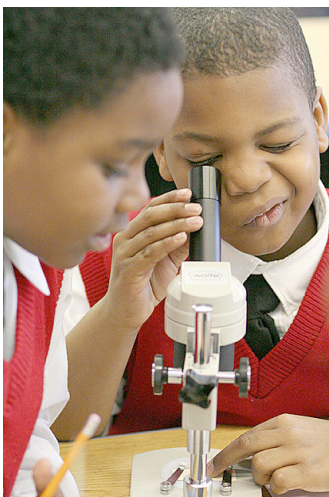
Where We Stand: America's Schools in the 21st Century presents a revealing assessment of America's schools. Among those visited is Harlem Children's Zone in New York City, pictured above.

9:00 p.m. Objects and Memory (Social Studies) 10:00 p.m. Any School Any Time (Guidance/Social Studies) 11:00 p.m. Where We Stand: America's Schools in the 21st Century (Educator's Interest)