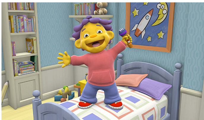
Sid the Science Kid is a new educational animated television series that promotes discovery and science readiness for preschoolers. Support materials are available at pbskids.org . Sid begins each day by asking a question and then sets out to discover the answer.

6:30 a.m. (Monday through Friday) Sid the Science Kid 9:00-10:30 a.m. (special preview) Sid the Science Kid 7:00 p.m. PBS Convention Coverage- A Newshour Special Report "Republican Convention" (Social Studies)