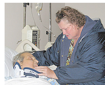
POV's "Critical Condition" puts a human face on the nation's growing health care crisis.

8:00 p.m. P.O.V. "Critical Condition" (Social Studies/ Personal Financial Literacy) 10:00 p.m. National Geographic Special: Killer Stress (Health Education/ Social Studies)